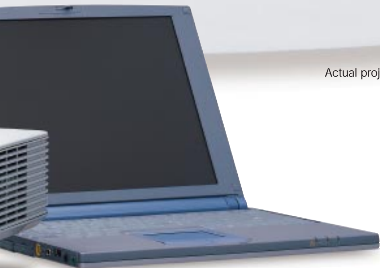
Actual projector size