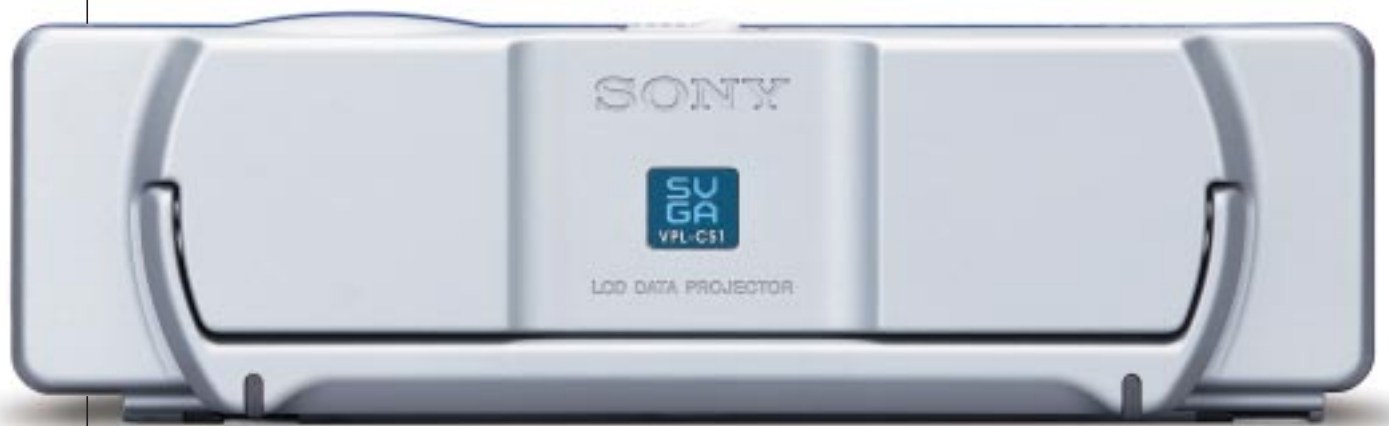
LCD Data Projector VPL-CS1

Your Presentations Will Take on a Whole New Look.